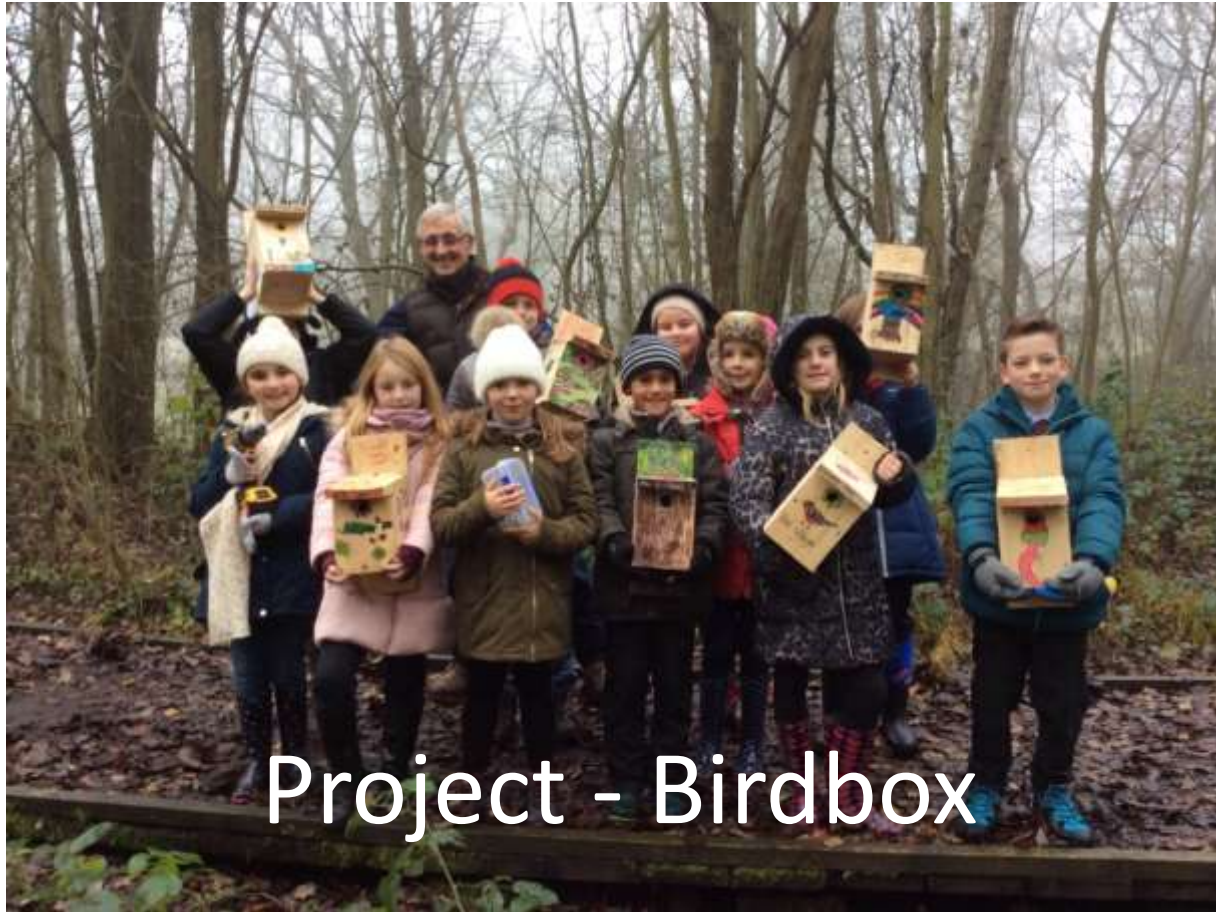
Project - Birdbox